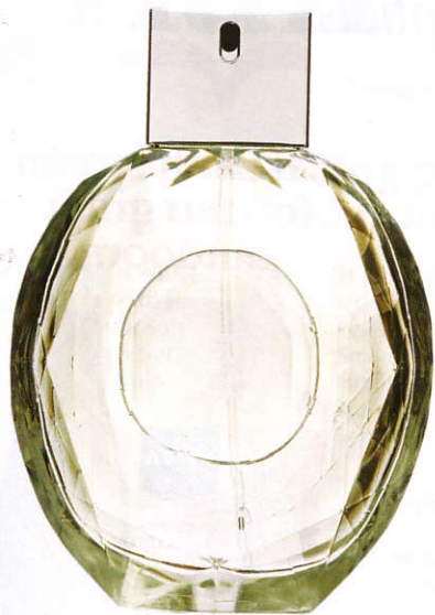
▲ WANT Emporio Armani Diamonds (featuring Beyonce)