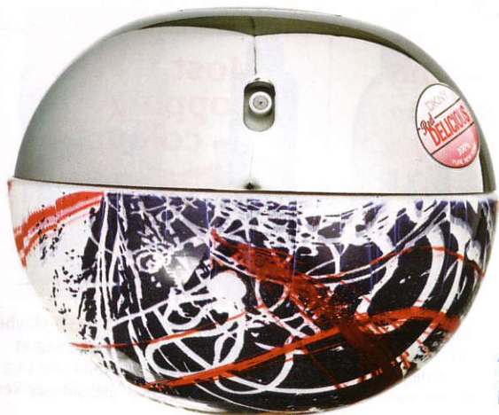
▲ NEED DKNY Red Delicious