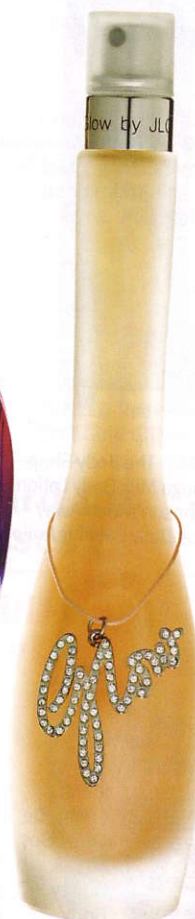
▲ NEED Glow by JLo Shimmer