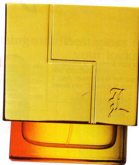
▲ NEED M by Mariah Carey + L by Gwen Stefani