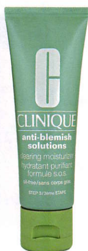
▲ WANT Clinique Anti-Blemish Solutions Clearing Moisturizer