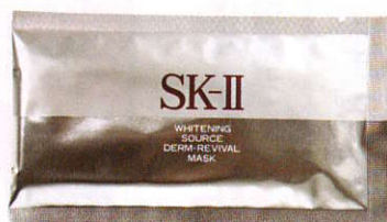
▲ WANT SK-II Whitening Source Derm-Revival Mask