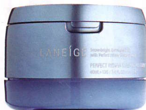
▲ NEED Laneige Perfect Renew Sleeping Treatment