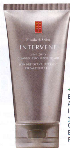
▲ WANT Elizabeth Arden Intervene 3-in-1 Daily Cleanser Exfoliator Primer