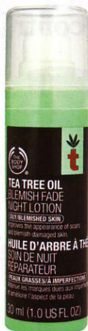
▲ NEED The Body Shop Tea Tree Oil Blemish Fade Night Lotion + Eucerin Skin Regulating Cream-Gel