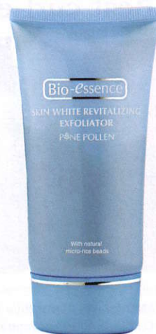
▲ NEED Bio-essence Skin White Revitalizing Exfoliator